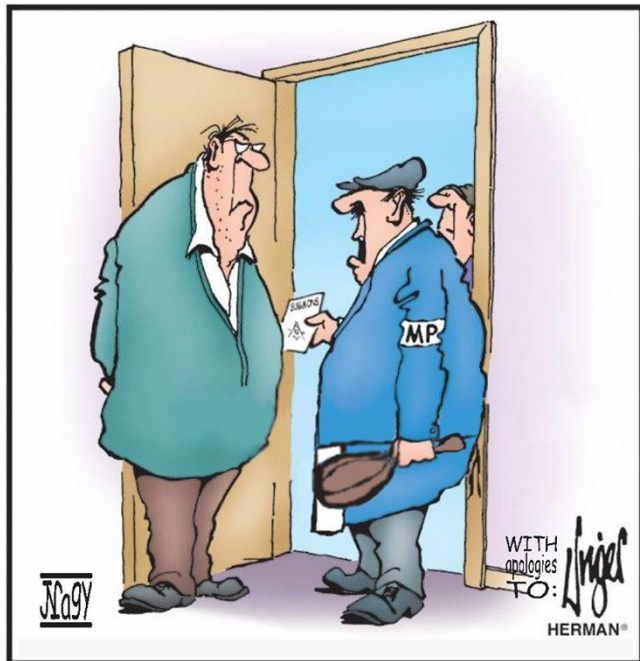
"Worshipful wants to know why you're not showing up for the Zoom meetings."